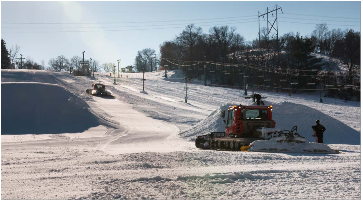
Workers build terrain park in Afton Alps, Minnesota.

Minnesota is committed to making its SLEDS data accessible to both government agencies and external researchers in order to promote a better understanding of education and workforce issues.